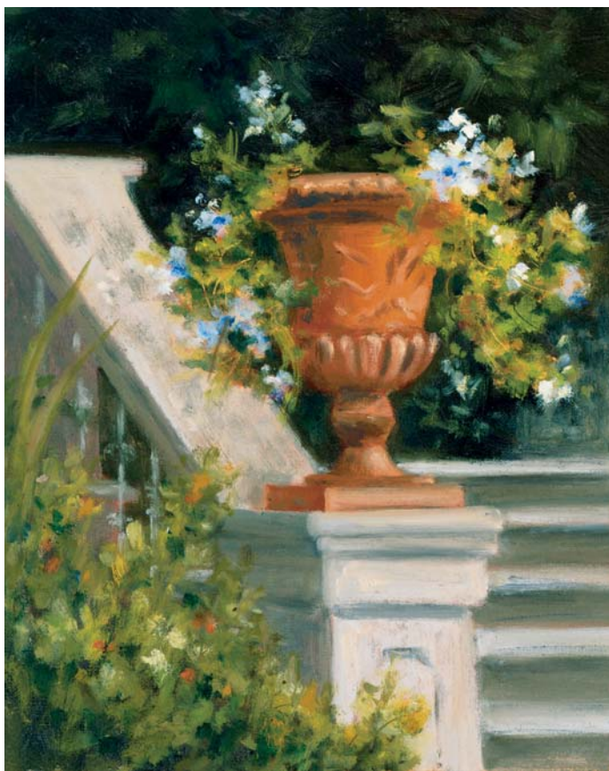
VILLA CIPRESE GARDEN, OIL, 8 x 6"