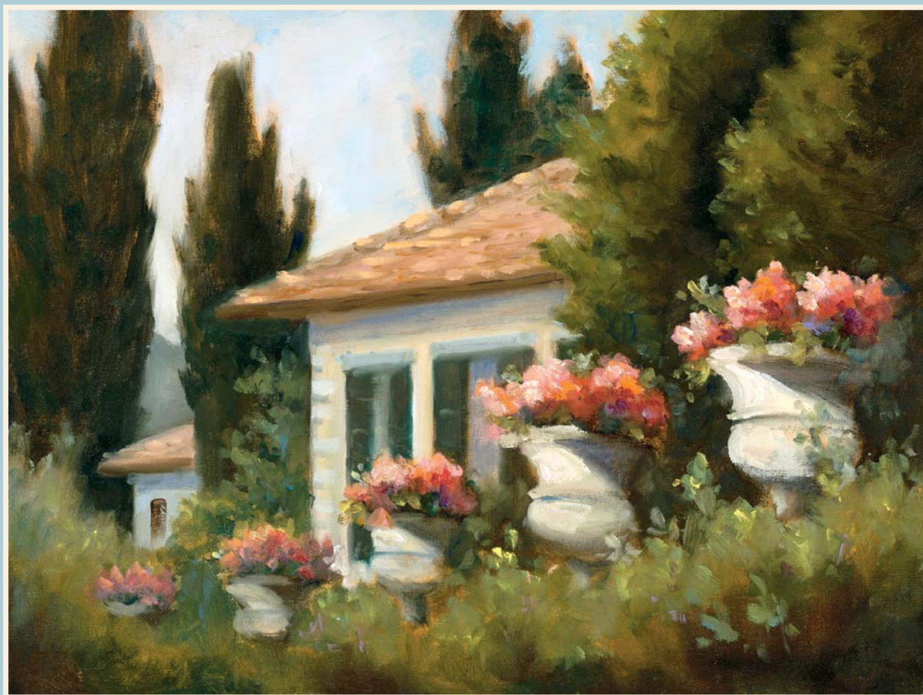
Siena Row I