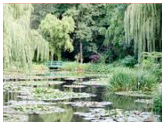
Claude Monet's garden in Giverny, France is four acres of lush landscape, including a lily pond with a Japanese bridge, and served as the inspiration for many of his paintings. (click for larger version)

Celebrated Impressionist artist Claude Monet once said, "My garden is my most beautiful masterpiece."